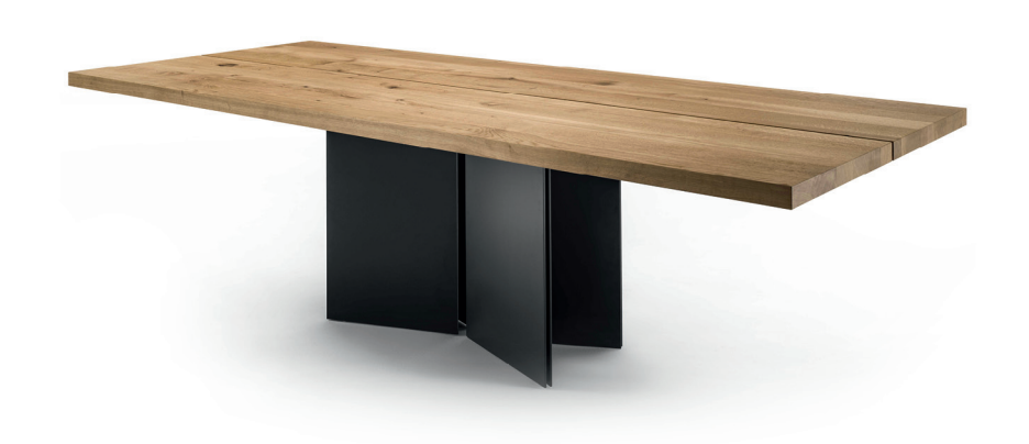
Table with top in glued lists, with middle gap and straight sides. Base in iron plate characterised by geometric lines.