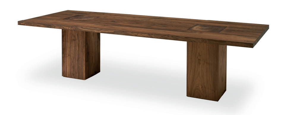
Table with top made of solid wood in glued lists, characterised by legs passing through the top surface, made from sections of tree trunks. Version with rectangular top and two legs.