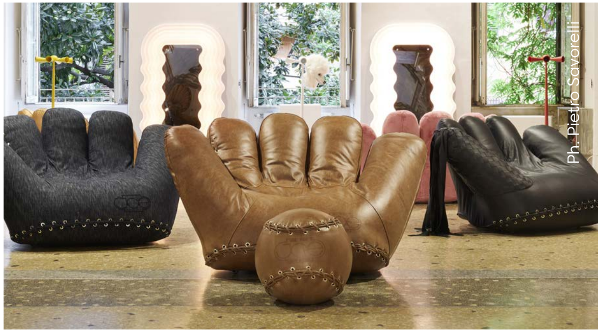
↶ The Student Hotel, Florence. 2020