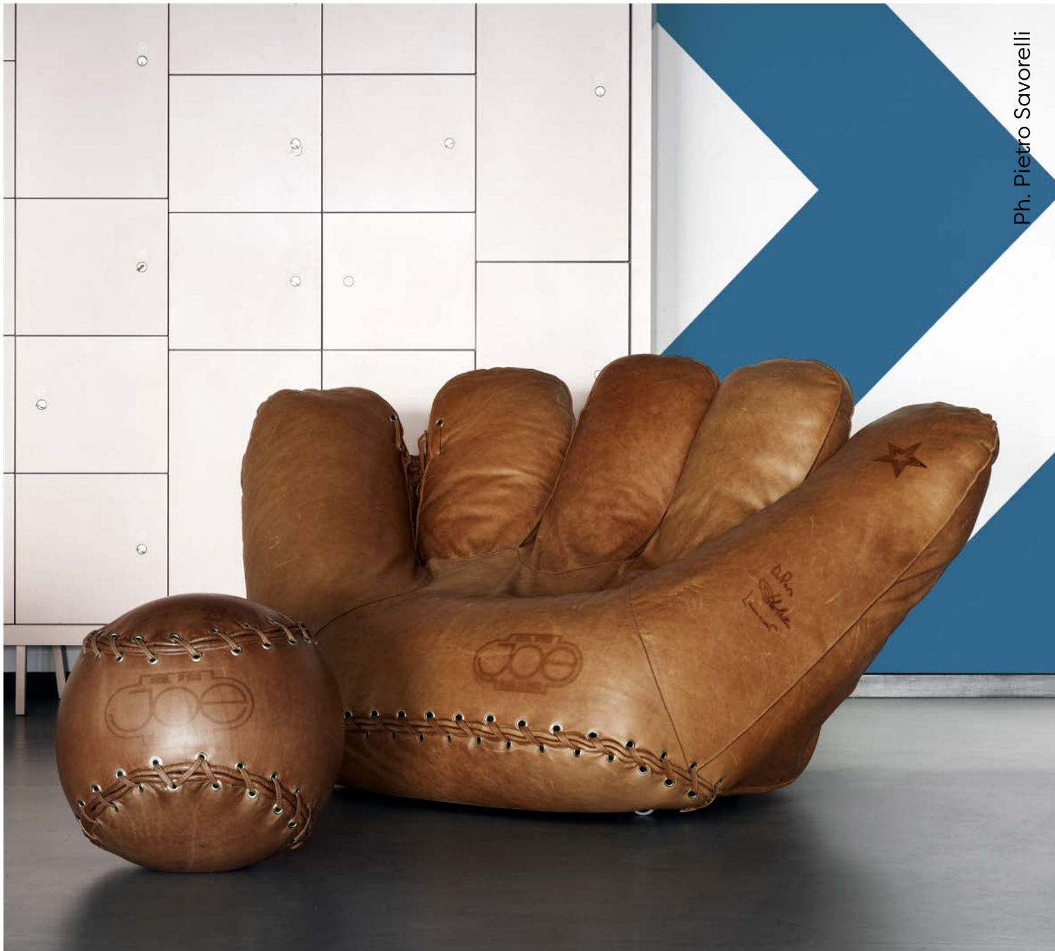
↶ The Student Hotel, Florence. 2020