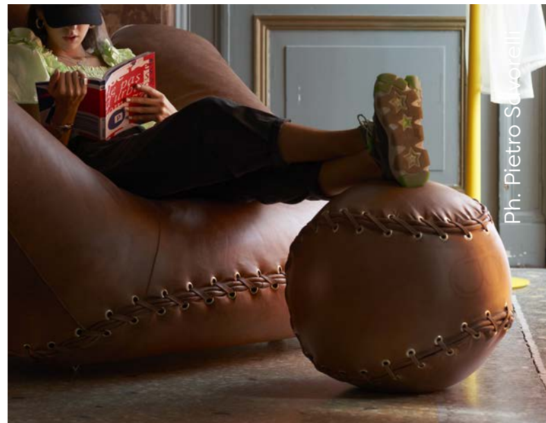
↶ Contemporary Cluster, Rome. 2020