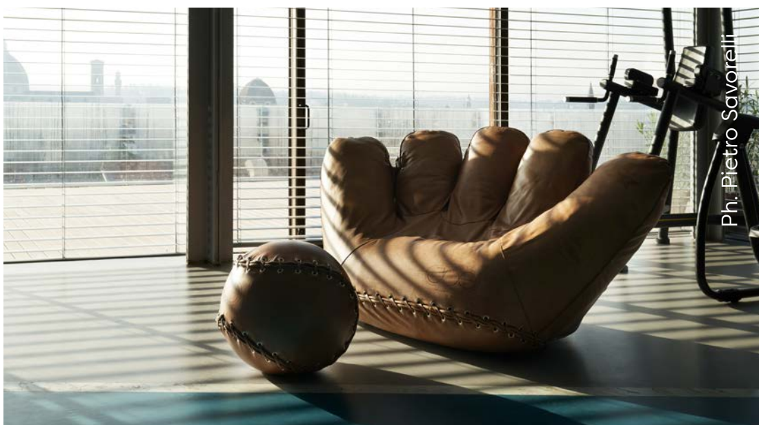
↶ The Student Hotel, Florence. 2020