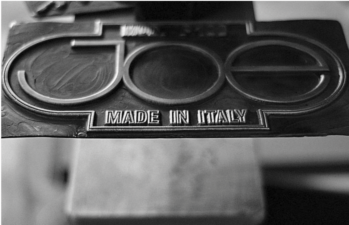
Poltronova factory, Aglia. 2020

To make the ball, our seamstress and our upholsterer take all the time they need to achieve the best result.