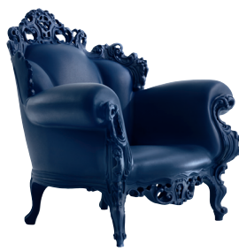
Matt color Blue 1192 C