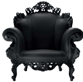
Matt color Black 1754 C