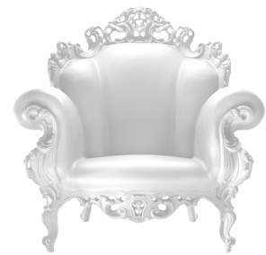
Matt color White 1735 C