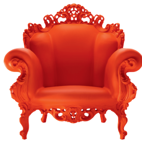
Matt color Red 1114 C