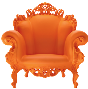
Matt color Orange 1087 C