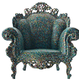
Matt color Multicolor