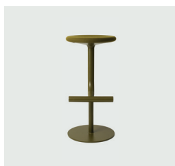
Frame: Olive Green 5039 Seat: Olive Green Kvadrat Steelcut 3 985