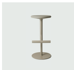
Frame: Beige 5123 Seat: Beige 1712 C (Polyurethane)