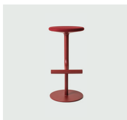
Frame: Bordeaux 5046 Seat: Bordeaux Kvadrat Steelcut Trio 686