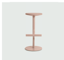
Frame: Pink 5089 Seat: Pink 1811 C (Polyurethane)