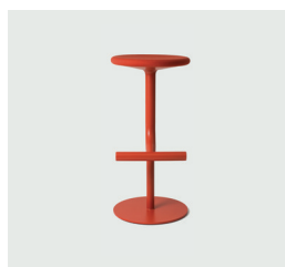
Frame: Coral Red 5084 Seat: Coral Red Kvadrat Steelcut Trio 533