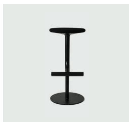
Frame: Black 5130 Seat: Black Kvadrat Steelcut 3 190