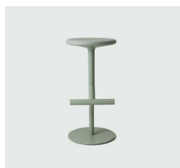
Frame: Light Green 5041 Seat: Light Green Kvadrat Steelcut Trio 906