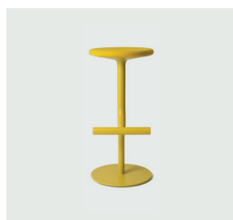
Frame: Lime 5029 Seat: Lime Kvadrat Steelcut Trio 446