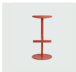
Frame: Coral Red 5084 Seat: Coral Red 1809 C (Polyurethane)