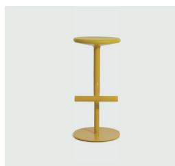
Frame: Lime 5029 Seat: Lime 1806 C (Polyurethane)