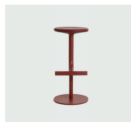
Frame: Bordeaux 5046 Seat: Bordeaux 1809 C (Polyurethane)