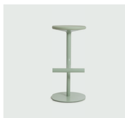
Frame: Light Green 5041 Seat: Light Green 1808 C (Polyurethane)