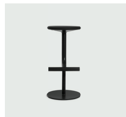
Frame: Black 5130 Seat: Black 1764 C (Polyurethane)