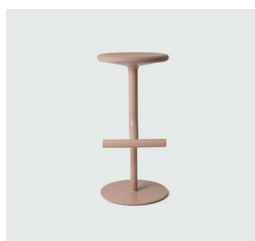
Frame: Pink 5089 Seat: Pink Kvadrat Steelcut 3 605