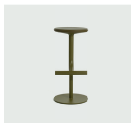
Frame: Olive Green 5039 Seat: Olive Green 1807 C (Polyurethane)