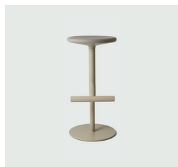
Frame: Beige 5123 Seat: Beige Kvadrat Steelcut 3 240